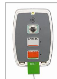
3-Button Peripheral Station with Pullcord