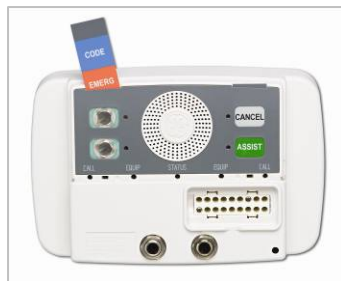
Single Patient Station without 37-pin BedConnect™