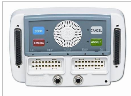
Dual Patient Station with 2 DuraPin Pillow Speaker receptacles, 2 configurable aux/call cord jacks, and 2 37-pin BedConnect receptacles (optional)